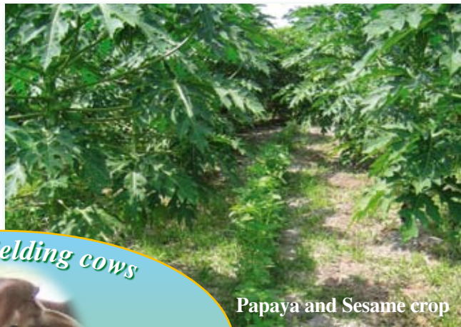
Papaya and Sesame crop