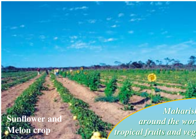
Sunflower and Melon crop