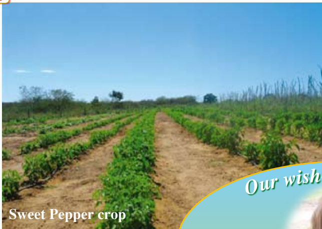
Sweet Pepper crop